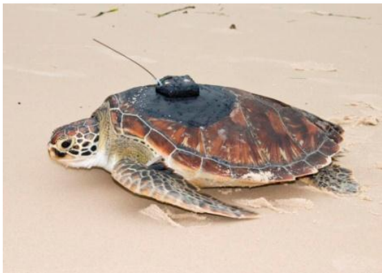
Crabby with her tag.