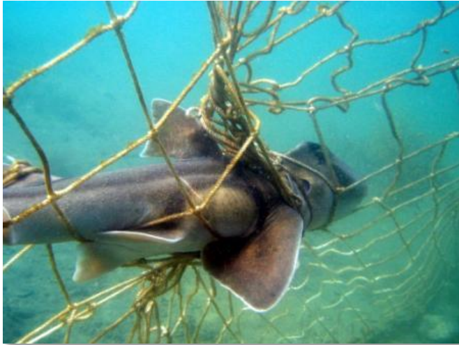
Port Jackson shark caught in shark nets.

Chris Neff has been in the press quite a bit lately due to several shark interactions occurring in WA. Chris' research 'Once Bitten, Twice Shy: The impact of shark attacks on public policies in Australia, South Africa and USA' endeavours to ask how the social and political framing of shark attacks impact the development of shark conservation policies in these countries.